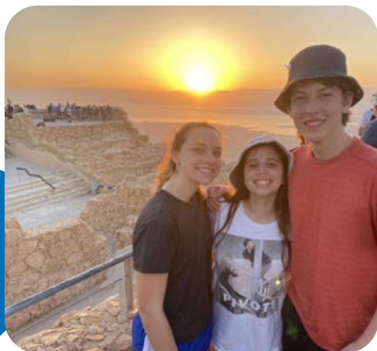
High School in Israel - Masada

You may also contribute to an existing Named Fund at TBS earmarked for youth scholarships and be counted in this fundraising effort. In addition, major gift naming opportunities are available. More information is available upon request.