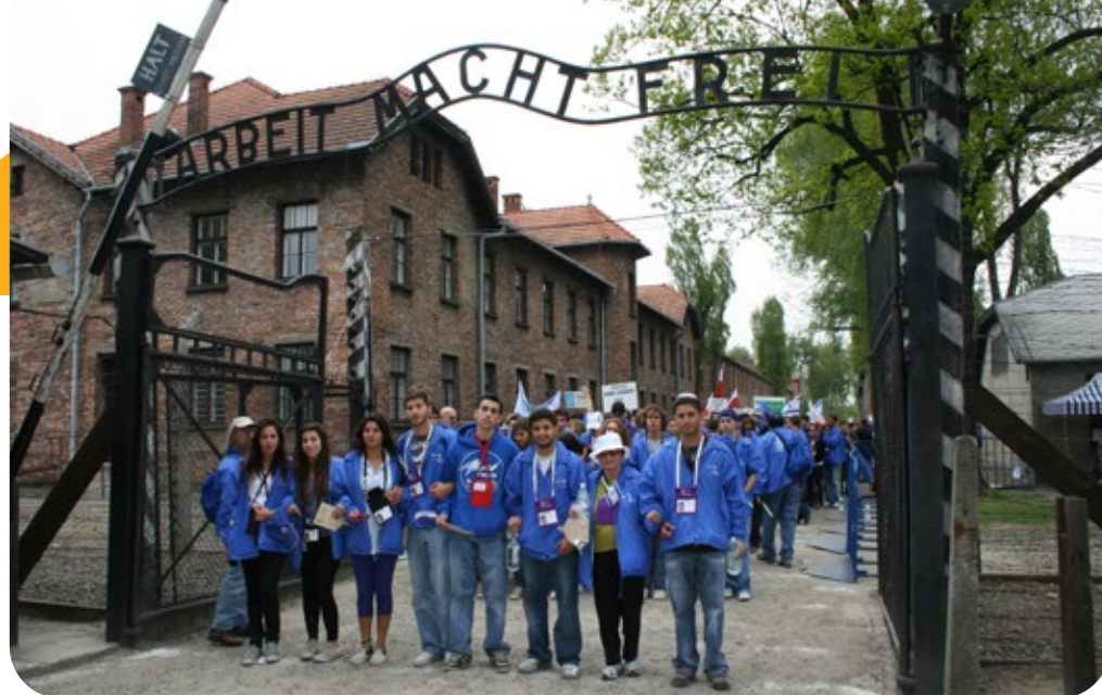
March of the Living