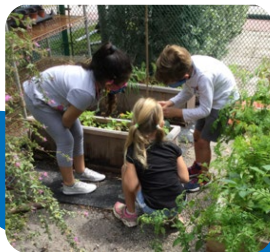
The Innovative School of Temple Beth Shalom play area