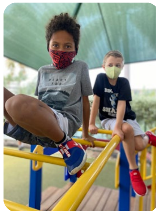
The Innovative School of Temple Beth Sholom play area

Around the edges of our campus, the first point of contact is our precious children in the playgrounds, both at the front main entrance and on the back waterfront. Like many synagogues around the country, we carefully review our security plans with experts in the field and make every effort to secure the perimeters of our beloved campus. Upgrades have been identified for both playgrounds. More information on these enhancements can be found online with the artist renderings of these spaces.