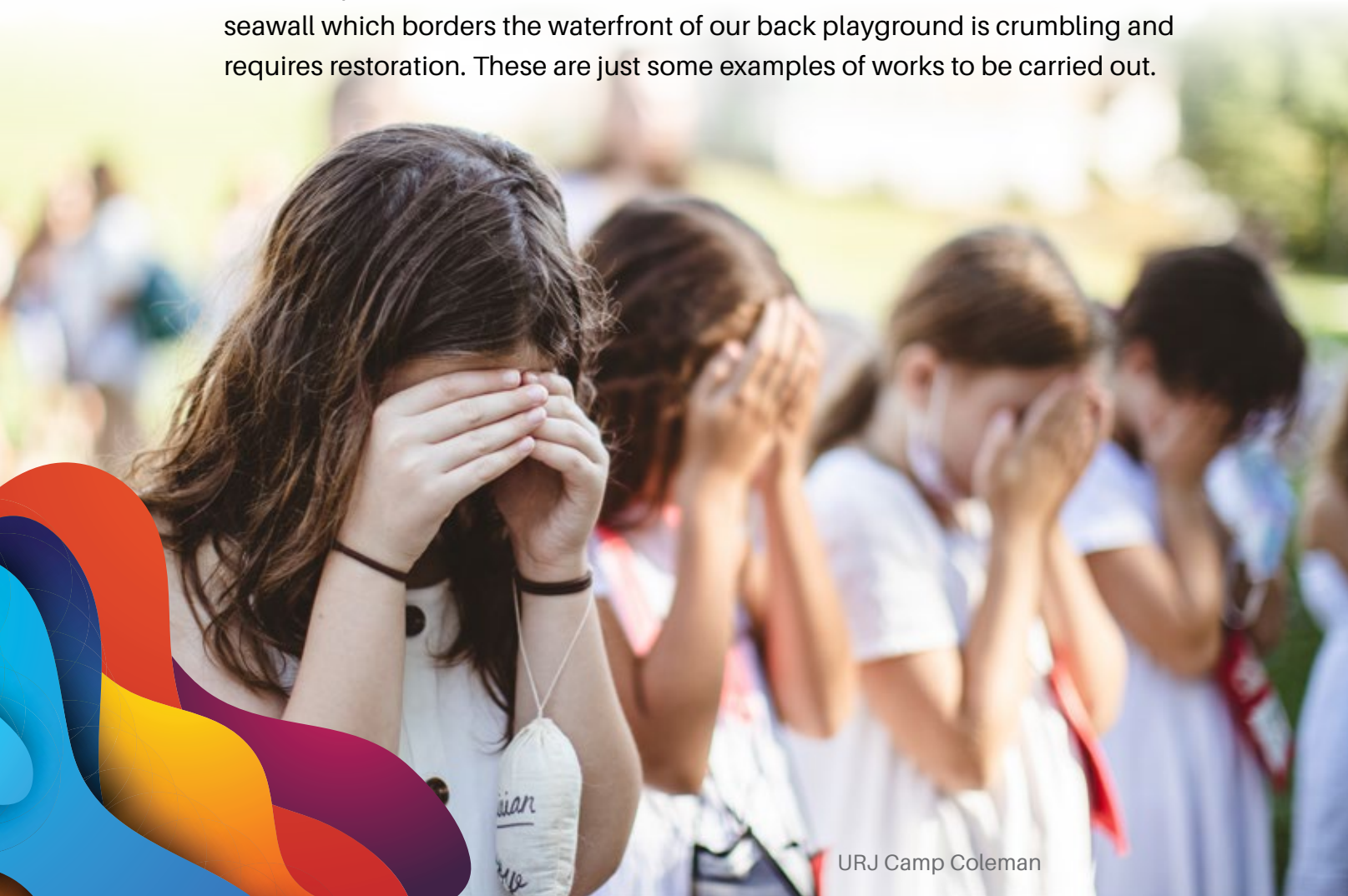
URJ Camp Coleman

Another vital area to address is our infrastructure , our spiritual home, which we strive to protect, secure, and enhance with thoughtfully planned renovations and upgrades. Our playground surfaces need to be replaced; outdated and underutilized equipment is to be removed; and additional security features are to be installed. A priority for the temple is to create an accessible and engaging outdoor space for older children with a basketball half-court. In addition, our seawall which borders the waterfront of our back playground is crumbling and requires restoration. These are just some examples of works to be carried out.